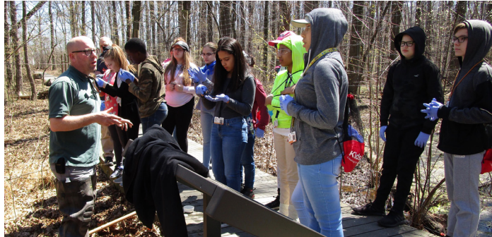
Hawk Rise Sanctuary

$10,000 grant from Infineum elevates real-world learning