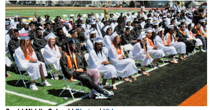
Soehl Middle School | Photos | Video