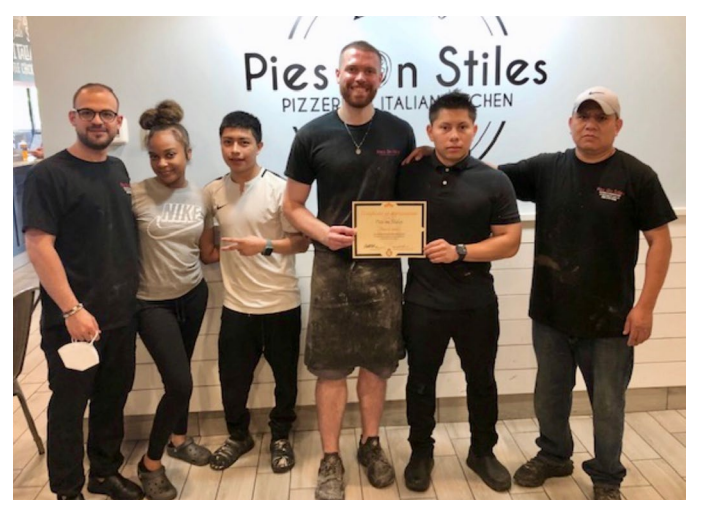
Pizza shop boosts LHS emotional wellness Pies on Stiles donated more than 50 pizzas as prizes for students who took part in weekly social emotional learning programs at Linden High School. Click here to learn more.