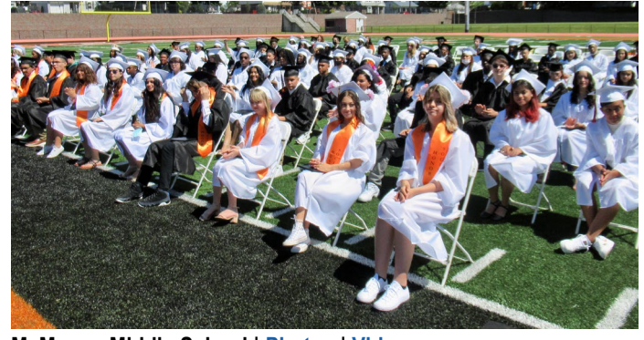
McManus Middle School | Photos | Video