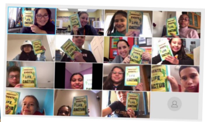
Click here to see more photos from Read Across America.