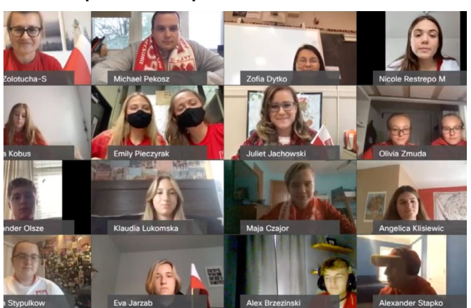
Polish Heritage Month wasn't the same, but technology allowed us to celebrate the culture and history. Click here to see video.