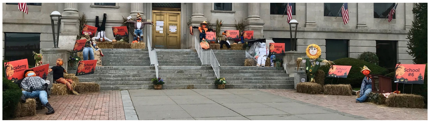
Each of our schools designed and created their own scarecrow to be on display during the Halloween season outside Linden City Hall. The project was sponsored by the Linden Halloween Parade Committee. Click here to see close-ups of each scarecrow.